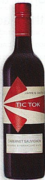
James Oatley Tic Tok Mudgee & Frankland River Cabernet Sauvignon 2008 ★★★★★

Ripe cassis nose with a pleasant, minty lift and an attractive, well-made, ripe fruit palate, nicely layered and beautifully balanced. $19