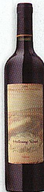
Morris of Rutherglen Rutherglen Cabernet Sauvignon 2008 ★★★★★

Simple, estery, blackcurrant bouquet and nicely layered palate with plenty of ripe fruit, tangy acid and drying tannins. $18.99